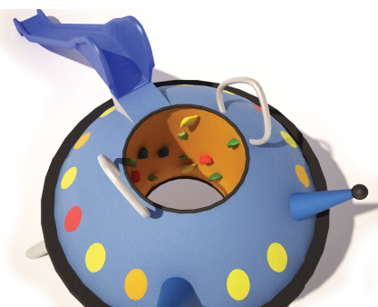
view inside the tube

standard: grey / blue / black / white (other combinations on request)